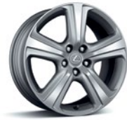
18-in five-spoke alloy wheels 3 Standard