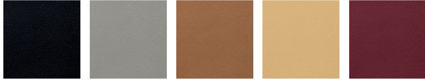
BLACK LEATHER or NULUXE STRATUS GRAY LEATHER or NULUXE FLAXEN LEATHER or NULUXE PLAYA LEATHER or NULUXE RIOJA RED* NULUXE