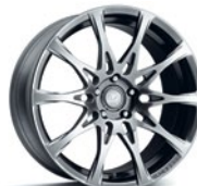
FSPORT 19-in full-face forged alloy wheels 3,11 Available AWD only