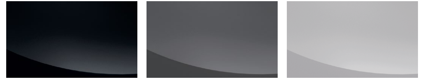
OBSIDIAN NEBULA GRAY PEARL SILVER LINING METALLIC