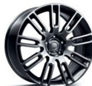
FSPORT 19-in split-nine-spoke alloy wheels 3,11 Available Winter 2014