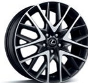
19-in split-10-spoke alloy wheels 3 RC FSPORT