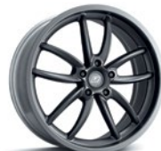
FSPORT 19-in forged alloy wheels 3,11 Available