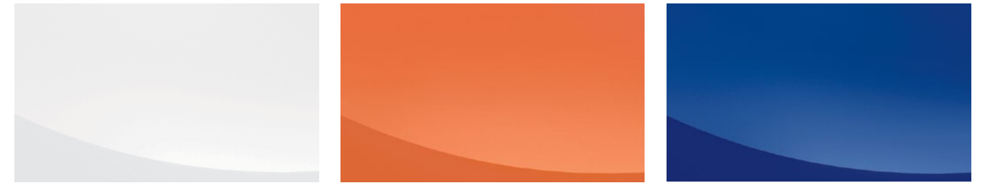
ULTRA WHITE* MOLTEN PEARL* ULTRASONIC BLUE MICA 2.0*‡