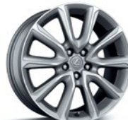
19-in split-five-spoke alloy wheels 3 Available