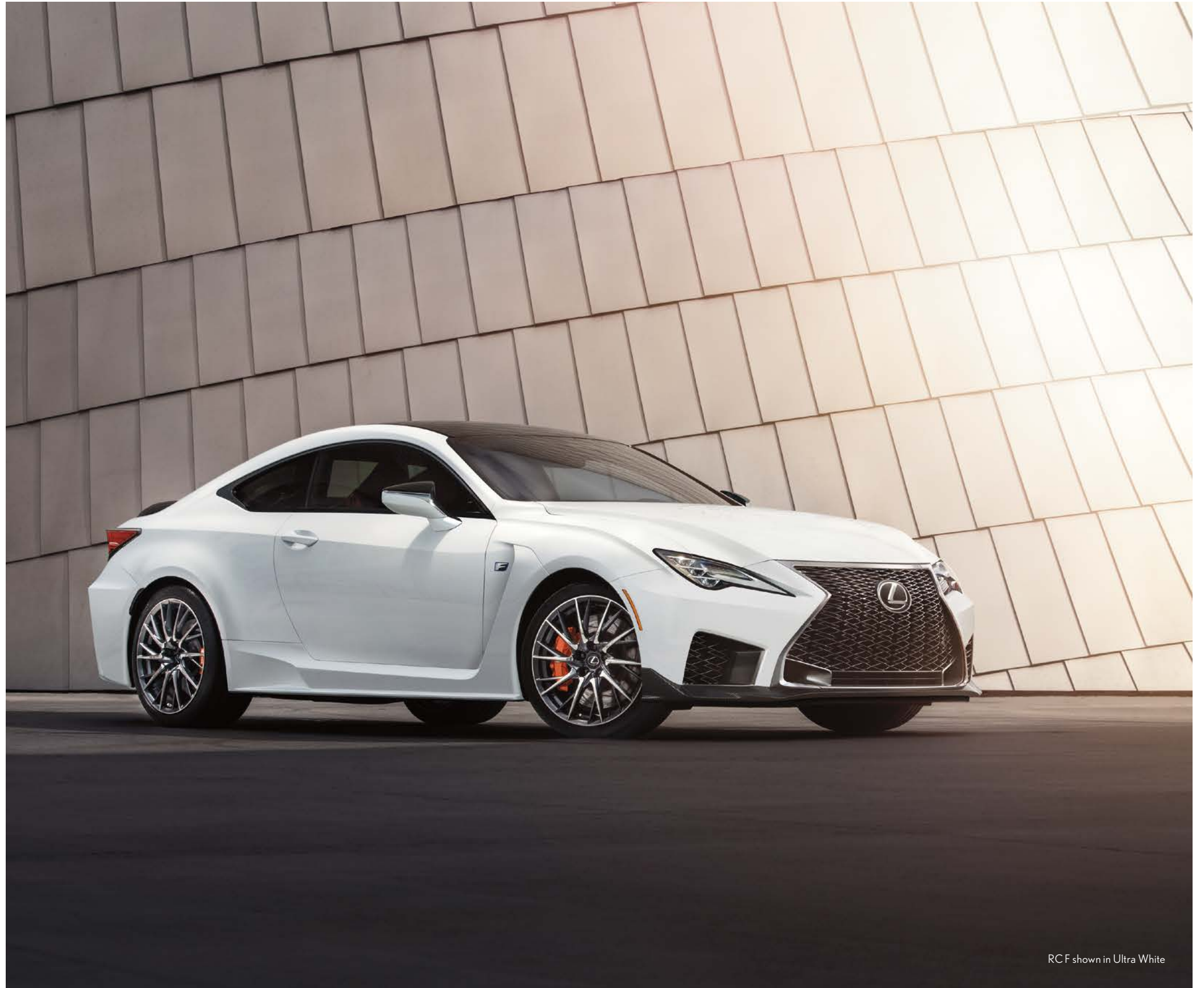
RCF shown in Ultra White