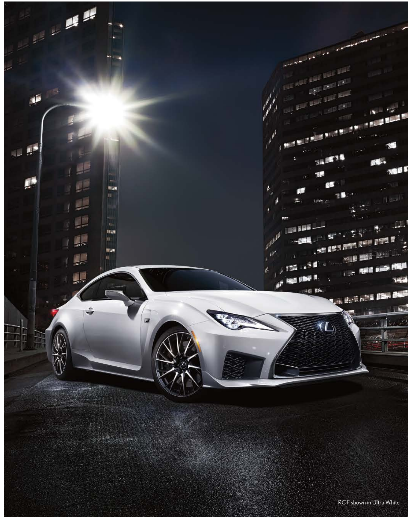
RC F shown in Ultra White