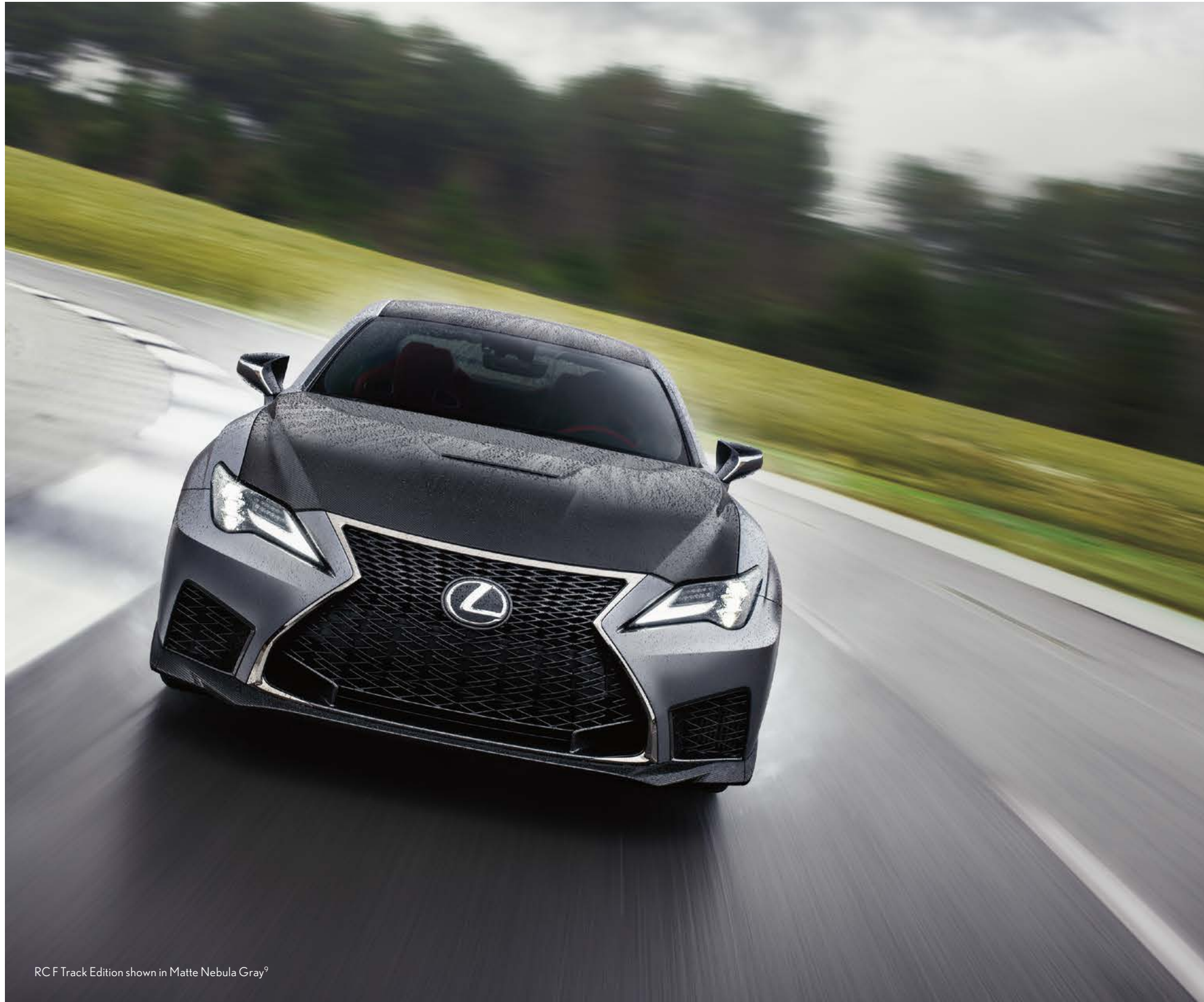
RC F Track Edition shown in Matte Nebula Gray 9