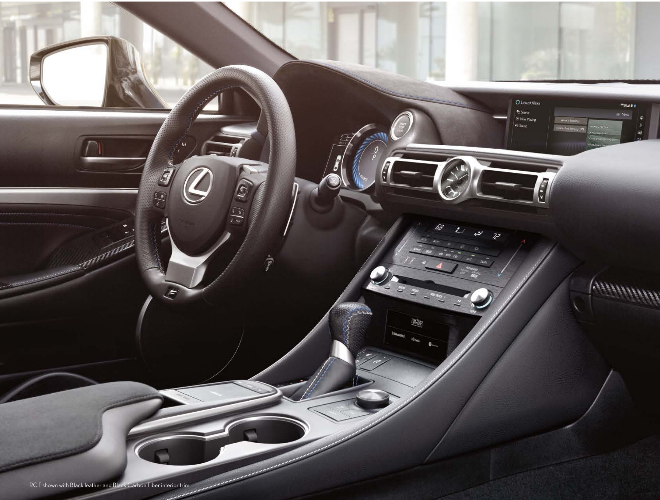
RC F shown with Black leather and Black Carbon Fiber interior trim