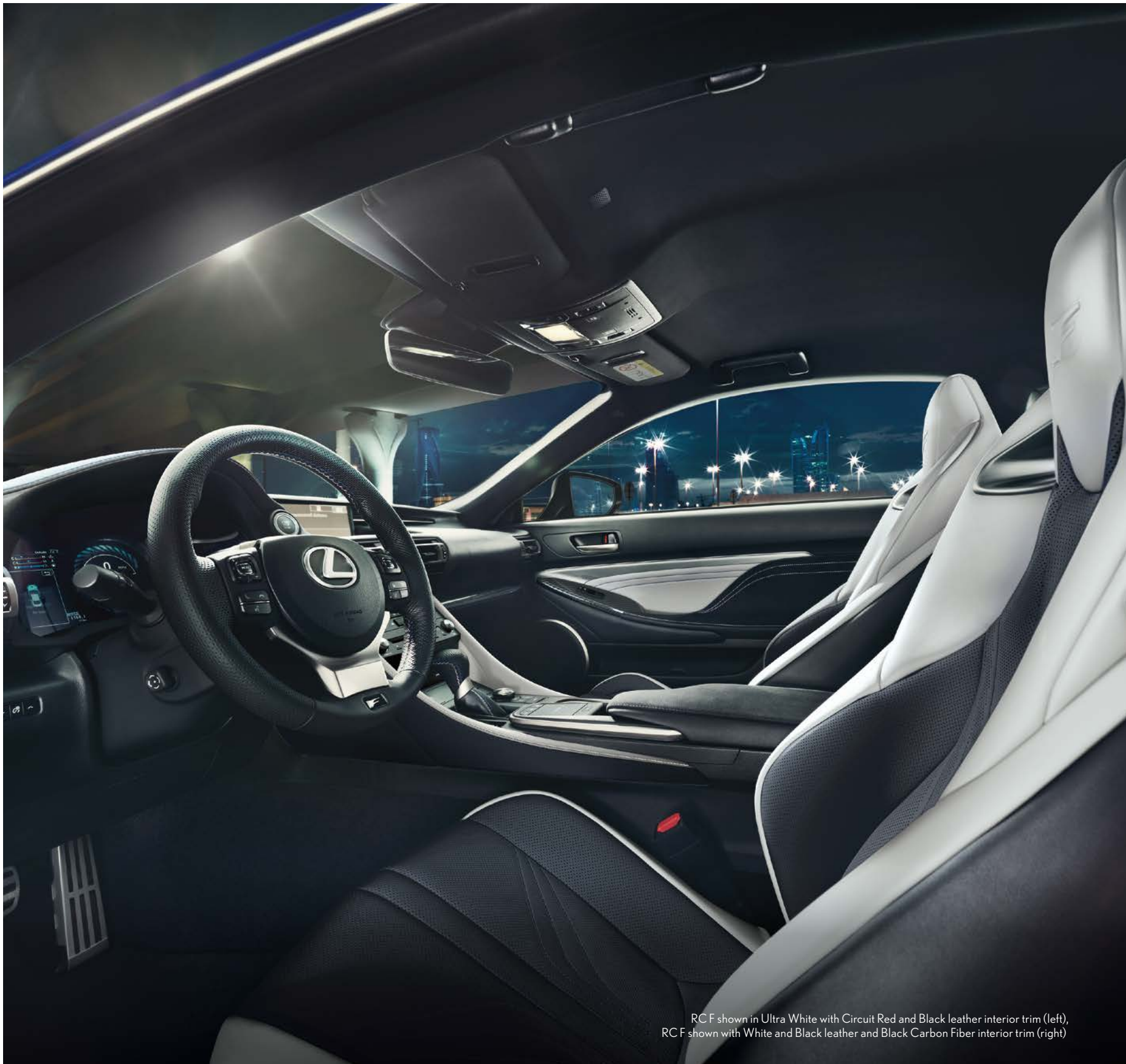
RC F shown in Ultra White with Circuit Red and Black leather interior trim (left), RC F shown with White and Black leather and Black Carbon Fiber interior trim (right)

The Performance Package features exclusive carbon fiber components, fabricated at the same workshop used to develop those on the world-renowned LFA supercar. With distinctive style and the same structural rigidity as standard steel components, the carbon fiber roof and speed-activated rear wing help increase vehicle stability at higher speeds for more responsive handling.