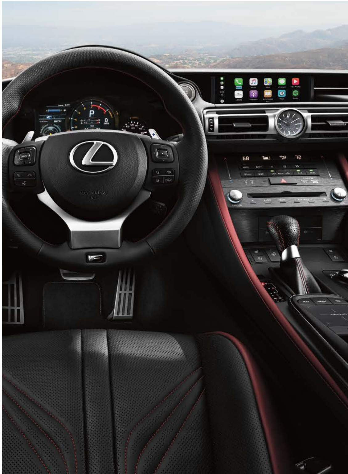
RC F shown with Apple CarPlay ®6 integration and Circuit Red and Black leather interior trim