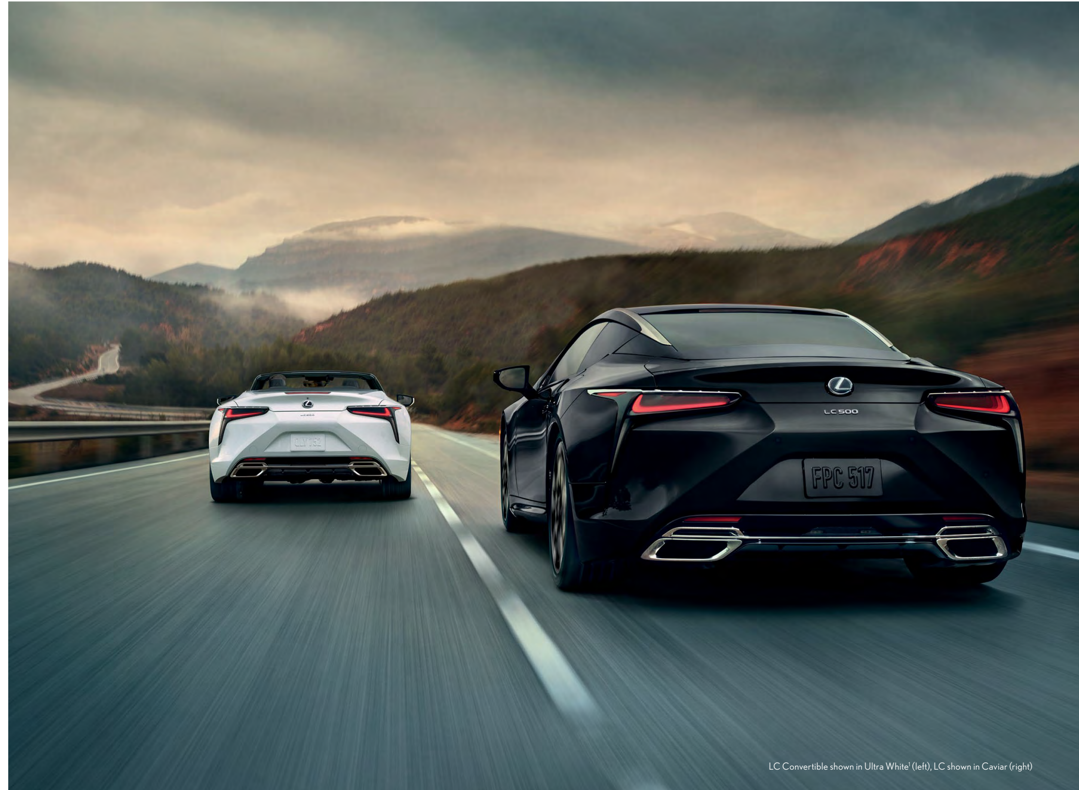
LC Convertible shown in Ultra White 1 (left), LC shown in Caviar (right)

A 10-speed Direct-Shift automatic transmission with magnesium paddle shifters was specifically designed for the LC. It changes gears in 0.12 seconds. Or, half the time it takes the average human to blink. The system also learns your habits every time you drive, selecting the optimum gear based on vehicle speed, acceleration and your driving style—even choosing the ideal gear while cornering.