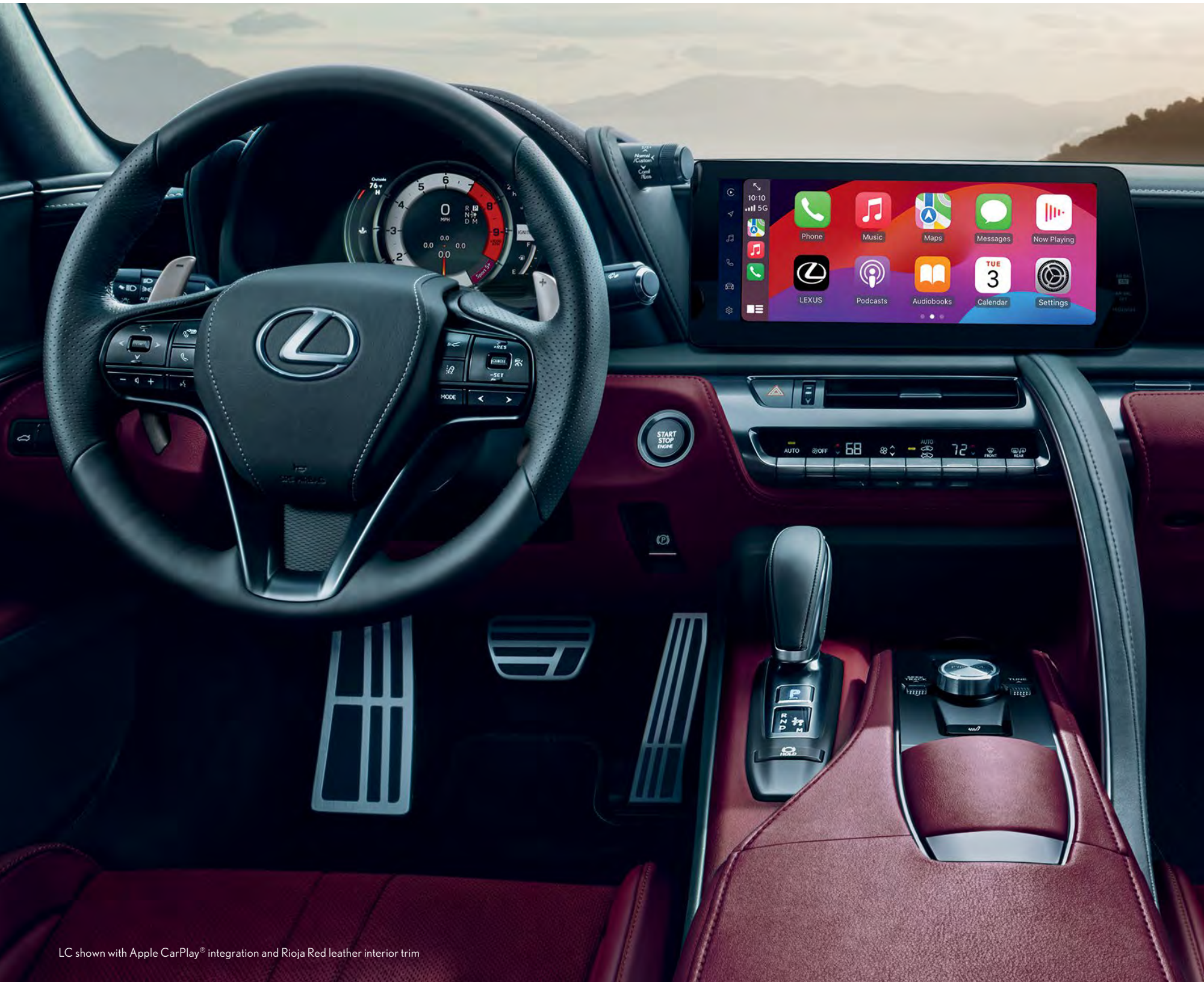
LC shown with Apple CarPlay® integration and Rioja Red leather interior trim