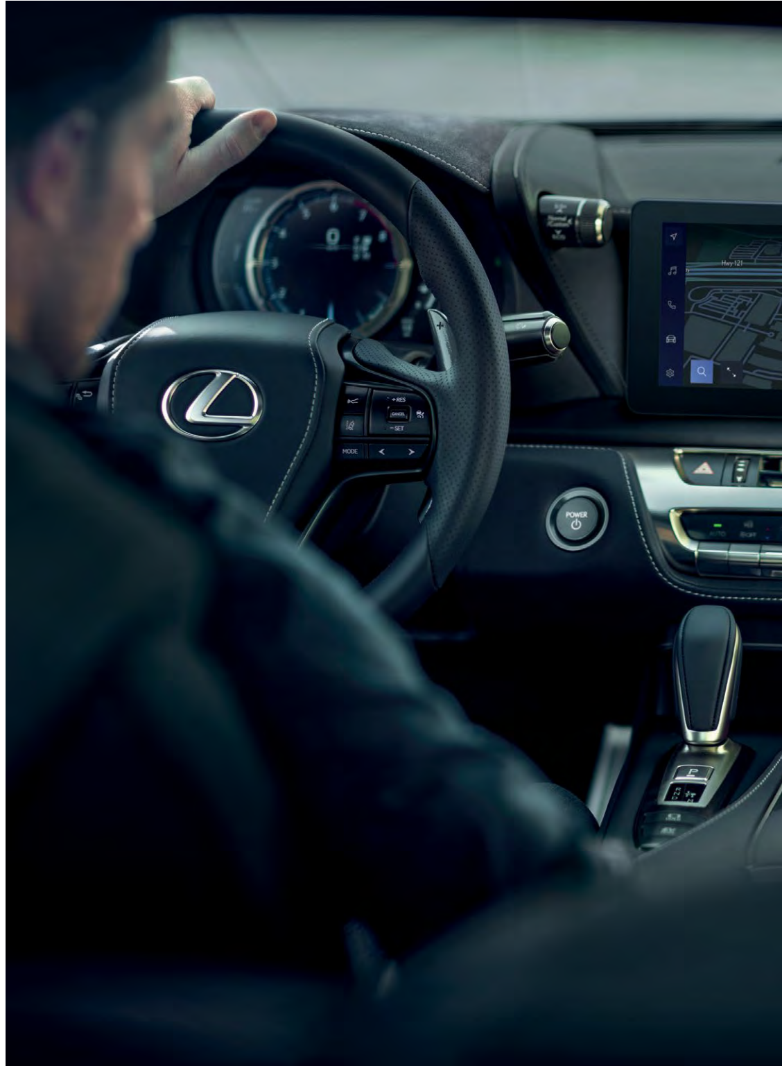
LC shown with Black leather interior trim