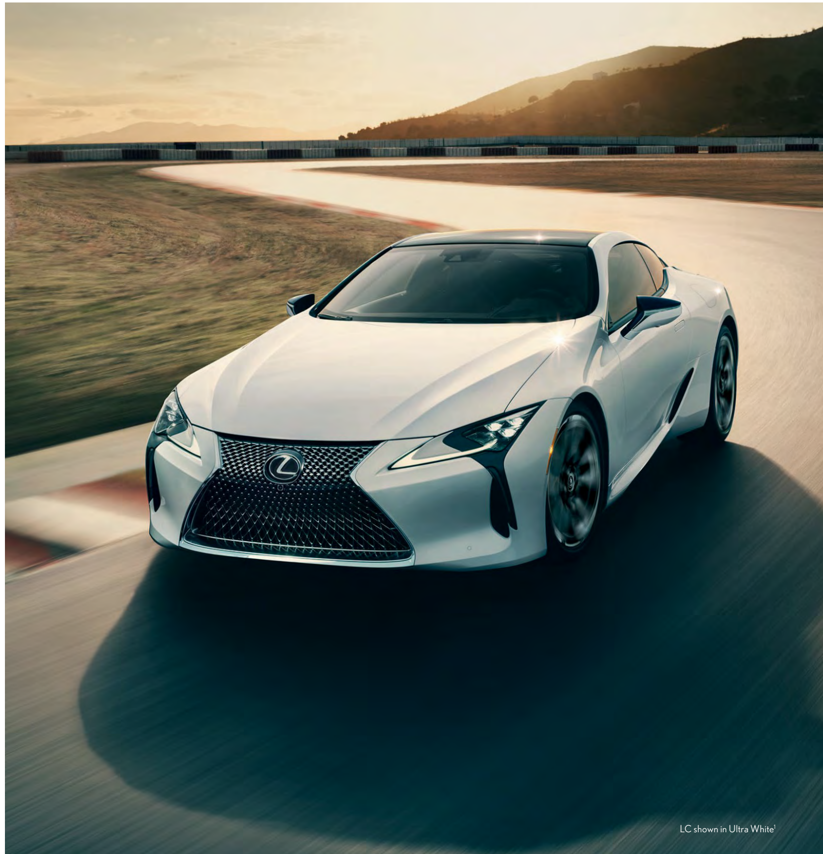
LC shown in Ultra White!