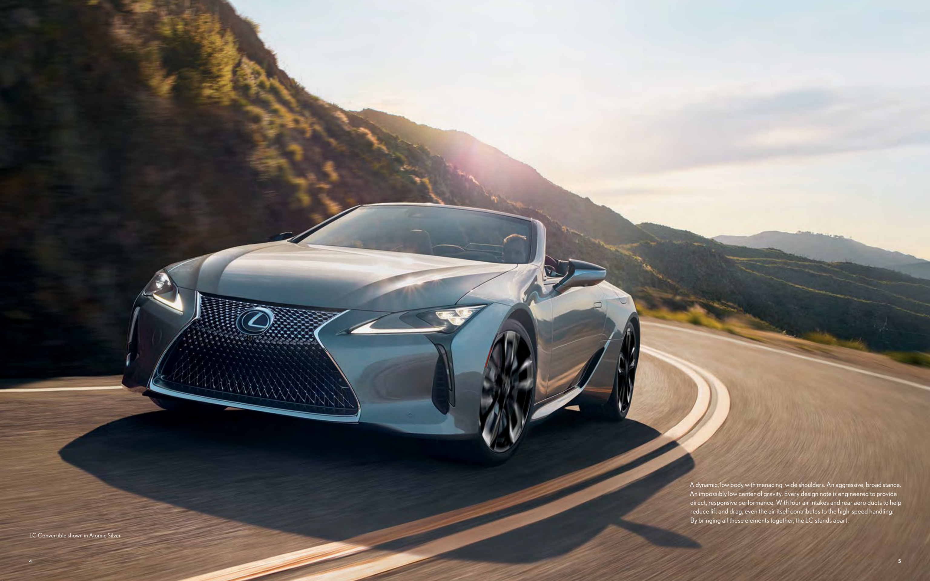
LC Convertible shown in Atomic Silver

A dynamic, low body with menacing, wide shoulders. An aggressive, broad stance. An impossibly low center of gravity. Every design note is engineered to provide direct, responsive performance. With four air intakes and rear aero ducts to help reduce lift and drag, even the air itself contributes to the high-speed handling. By bringing all these elements together, the LC stands apart.