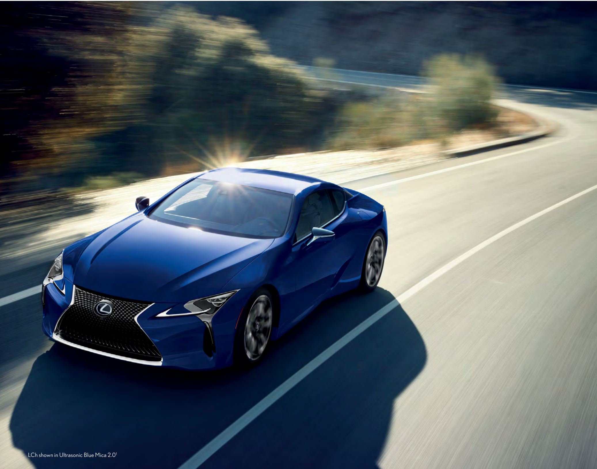
LC shown in Ultrasonic Blue Mica 2.0 1