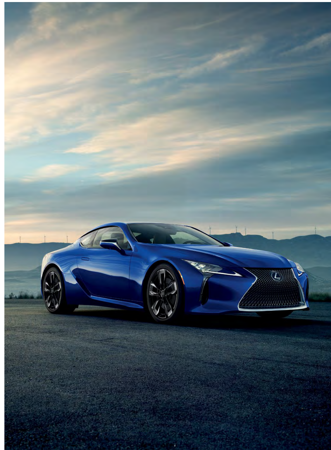
LCh shown in Ultrasonic Blue Mica 2.0 1

From the customizable Bespoke Build models to the thoughtful details you'll discover in the incomparable LC Convertible, every element is designed to elicit a response from the driver.