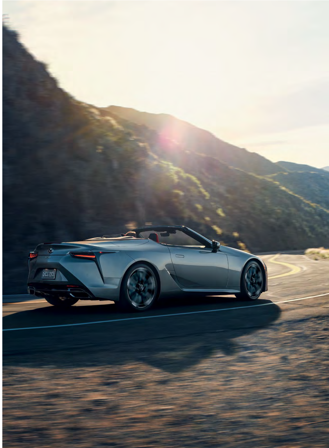
LC Convertible shown in Atomic Silver