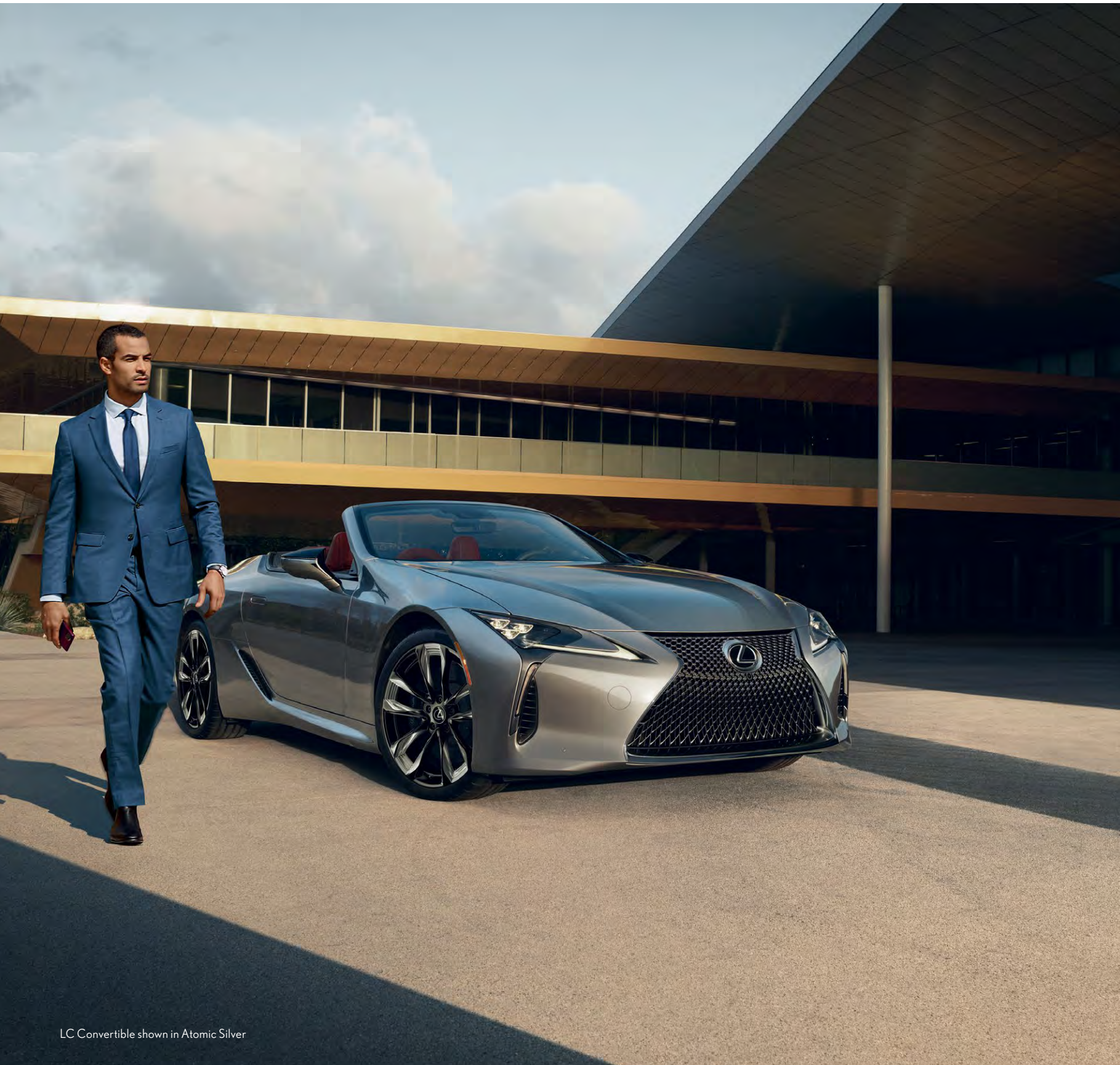
LC Convertible shown in Atomic Silver