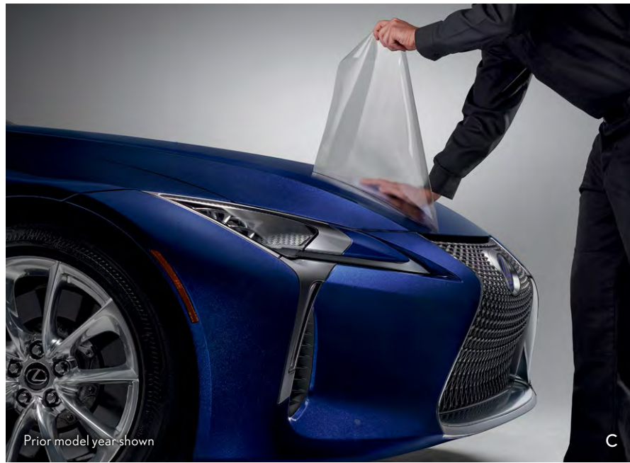
Prior model year shown