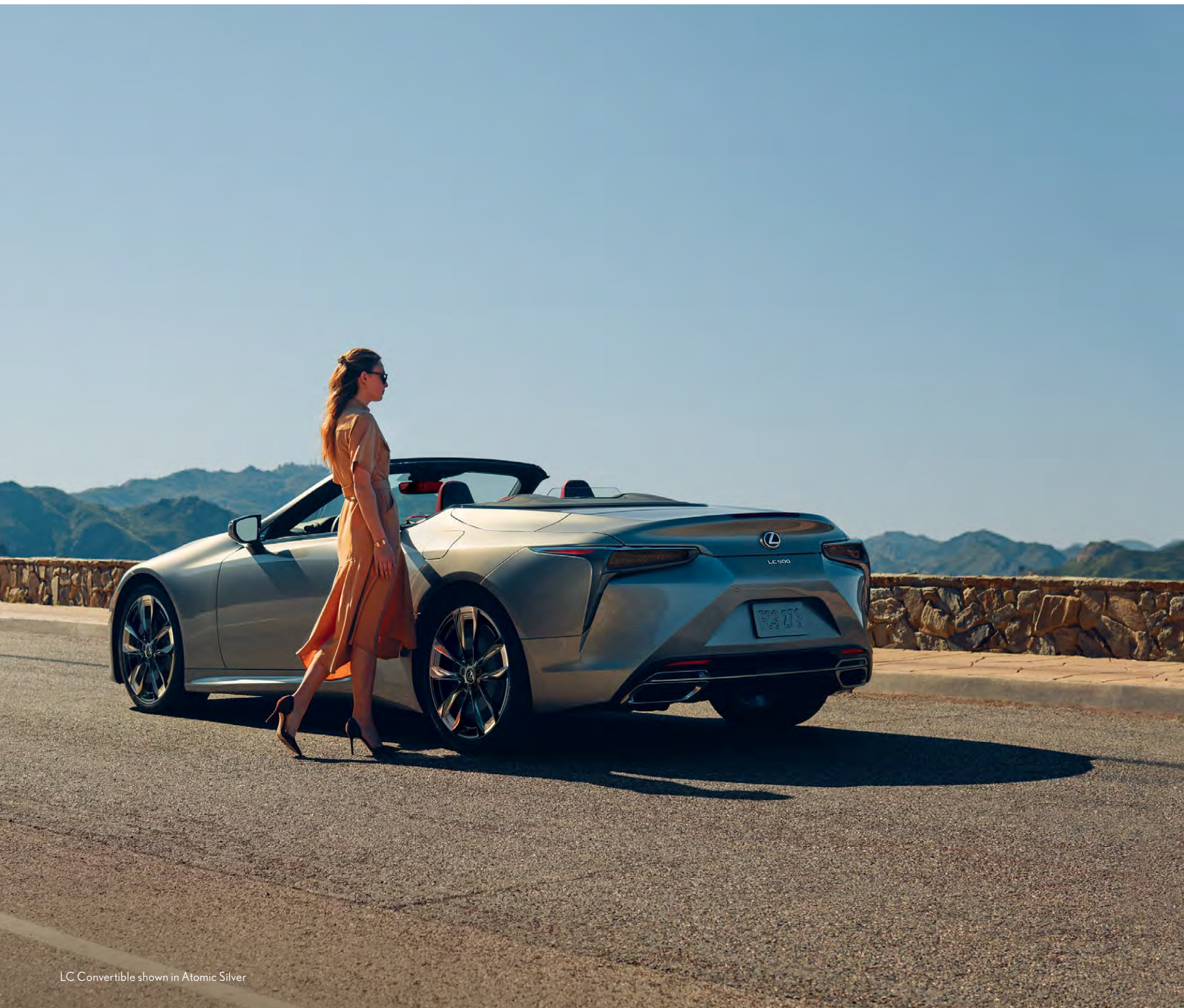
LC Convertible shown in Atomic Silver