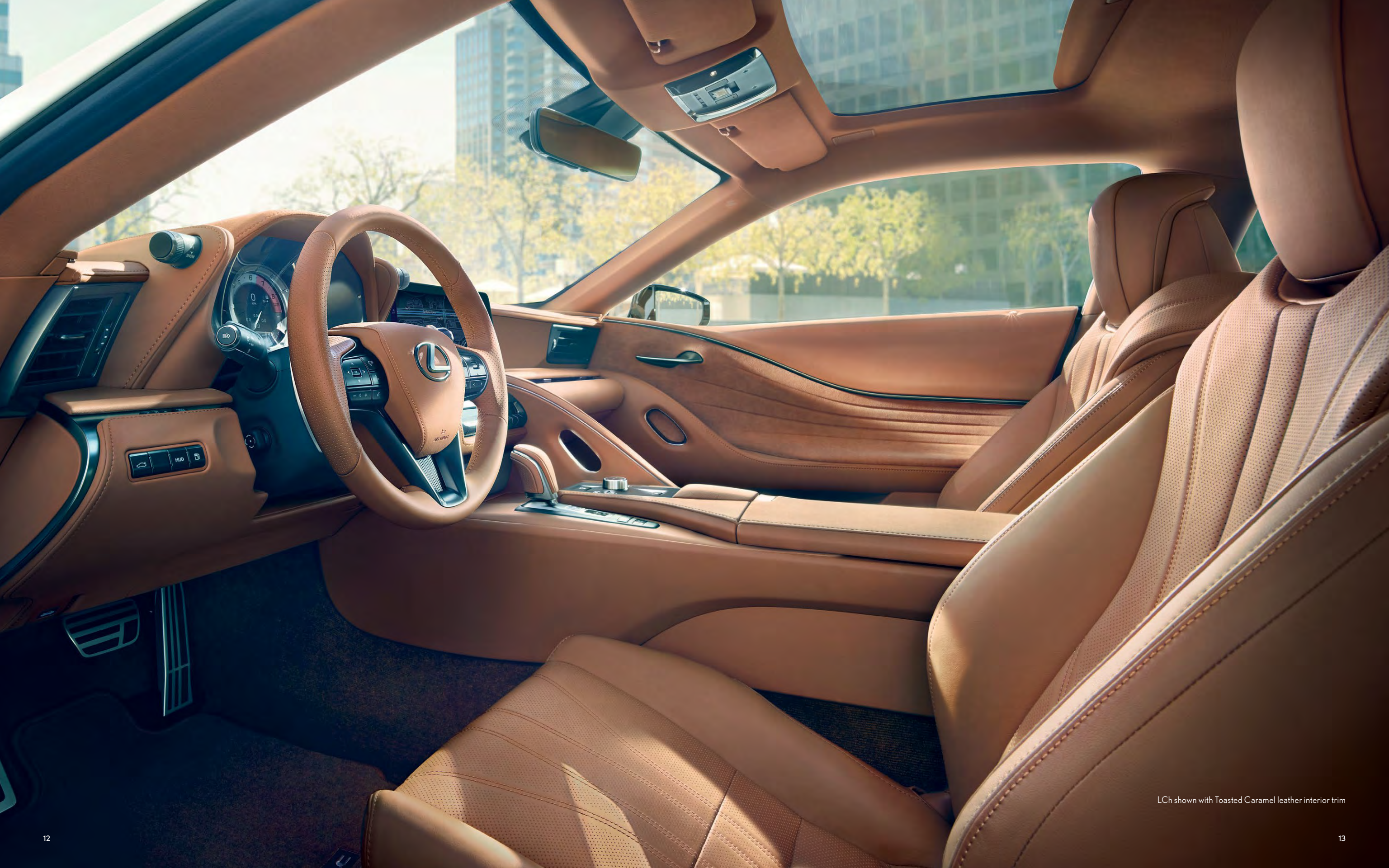
LCh shown with Toasted Caramel leather interior trim