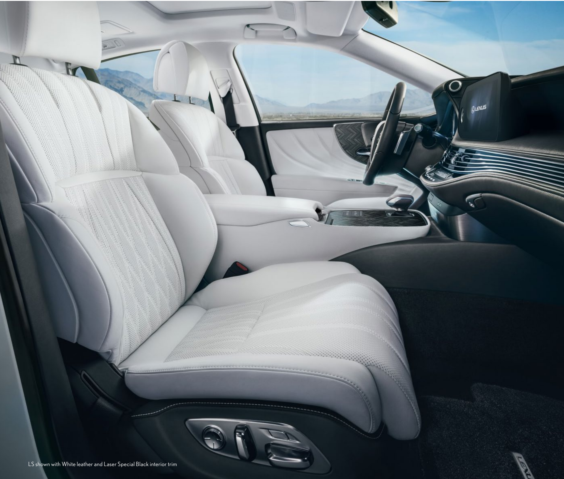
LS shown with White leather and Laser Special Black interior trim