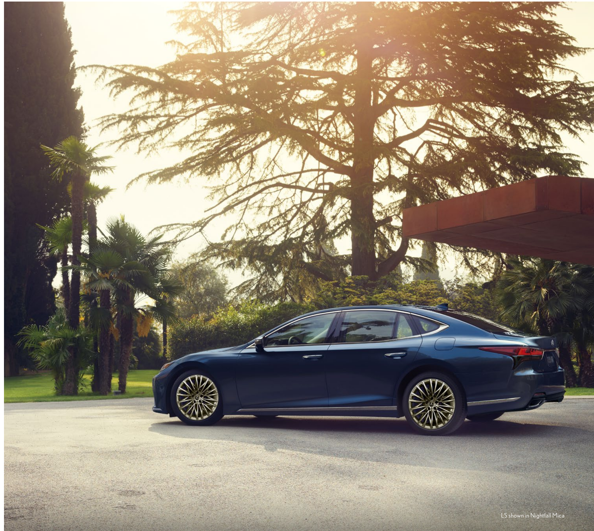
LS shown in Nightfall Mica

20-inch split-10-spoke alloy wheels with Gloss Black Metallic finish STANDARD LS F SPORT