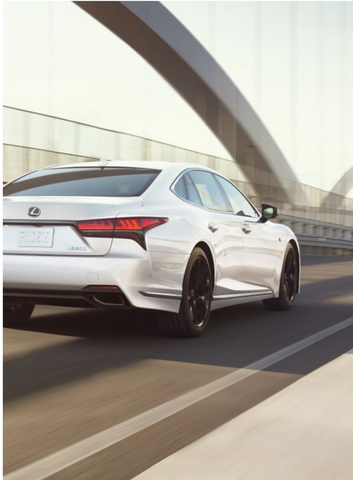
LS F SPORT shown in Ultra White 3