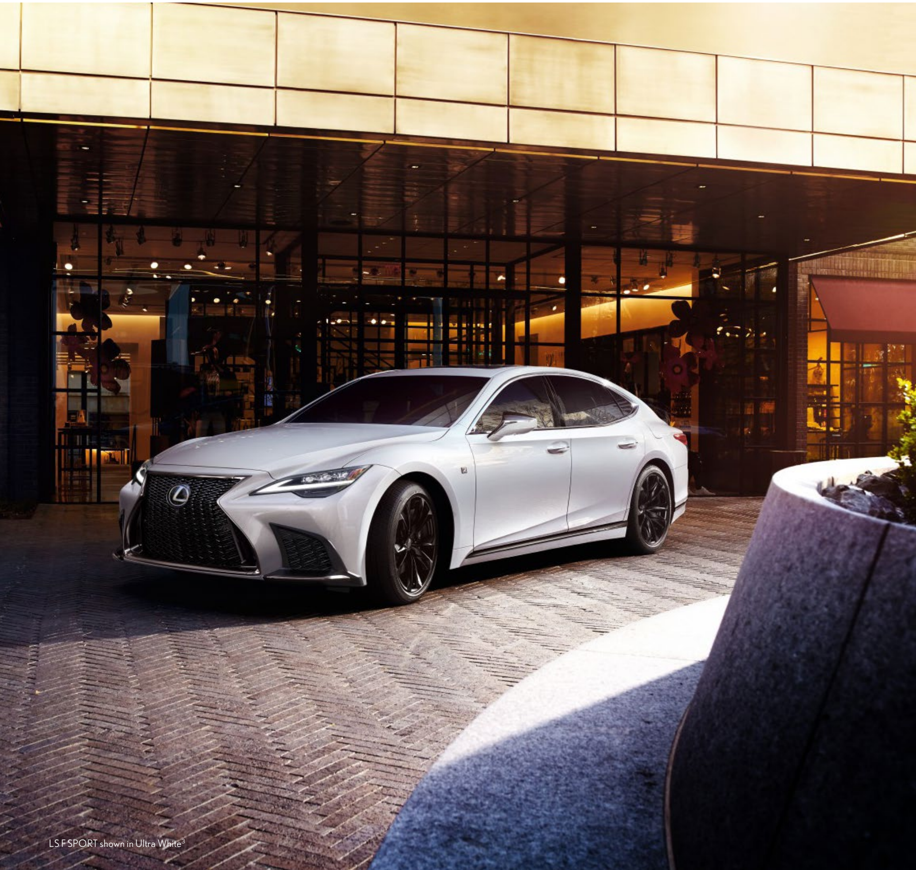
LS F SPORT shown in Ultra White 3