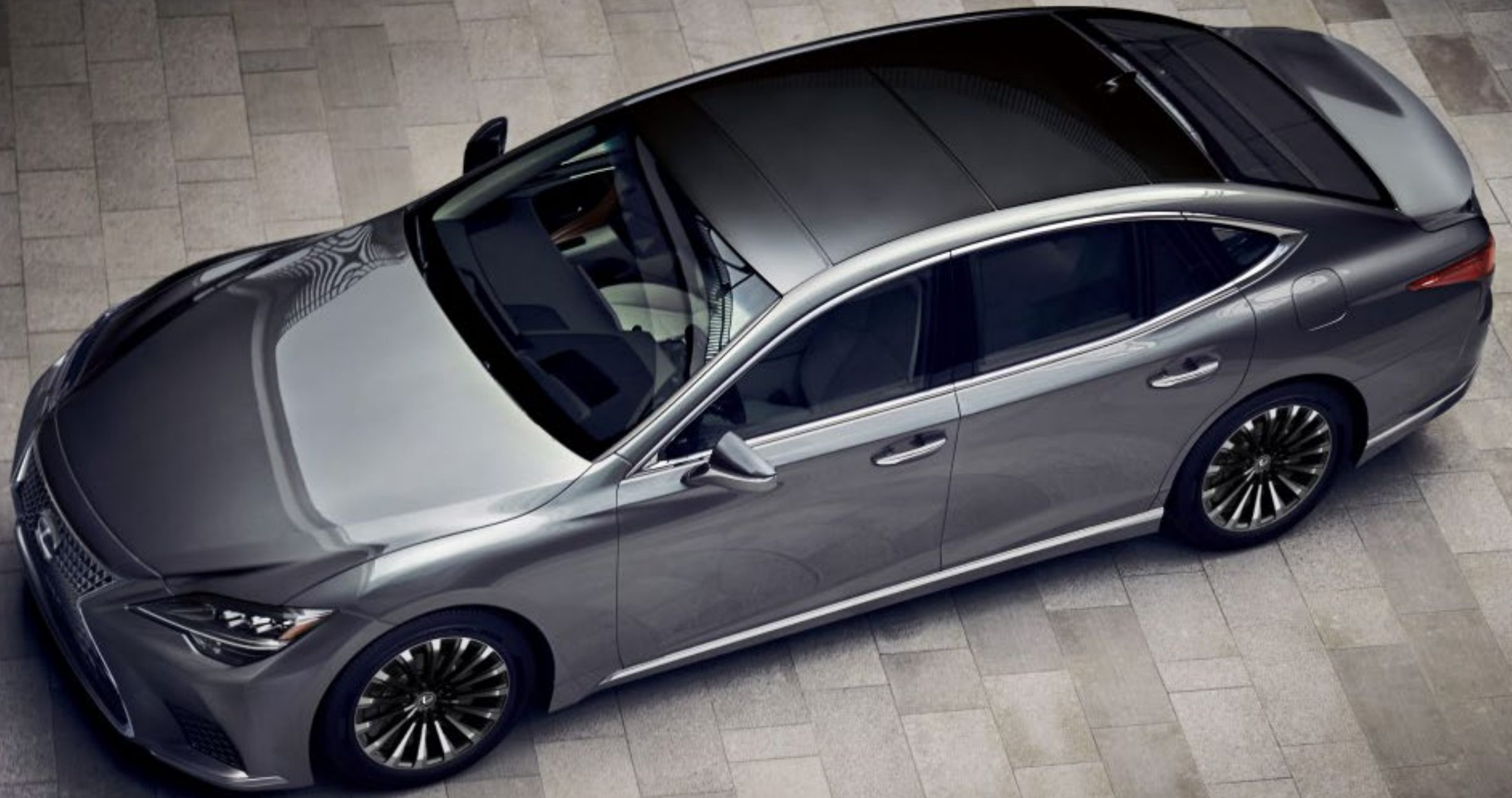
LS shown in Manganese Luster 3