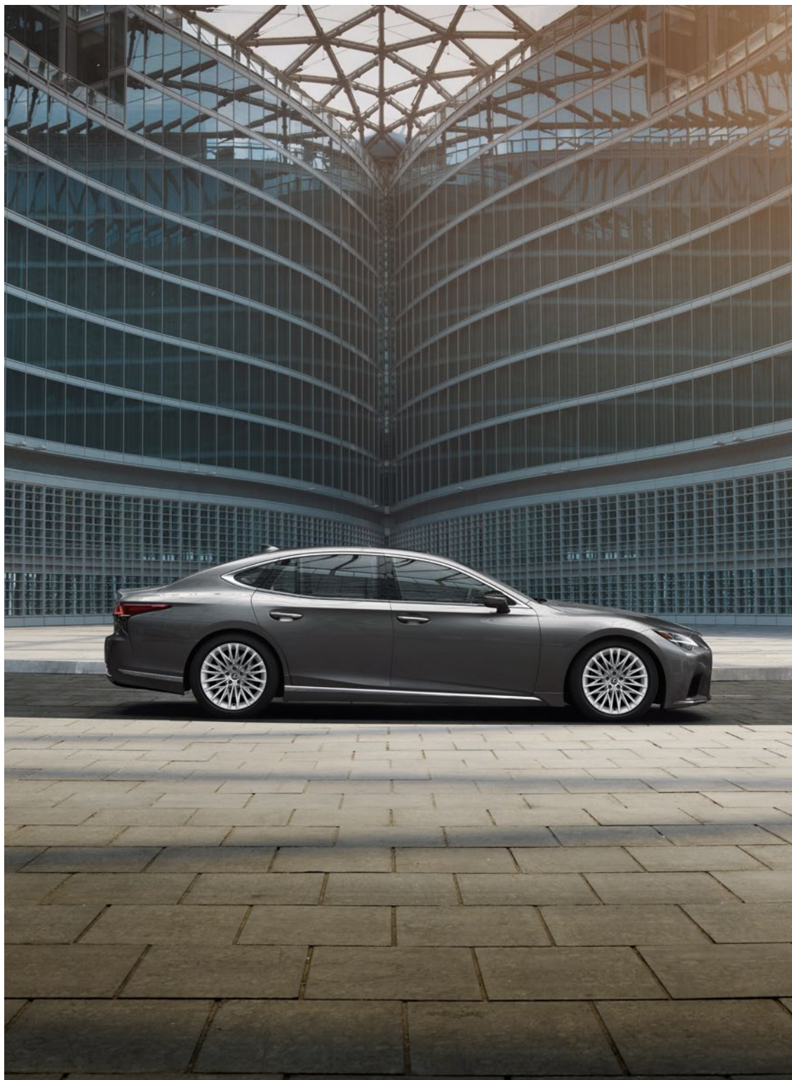
LS shown in Manganese Luster 3