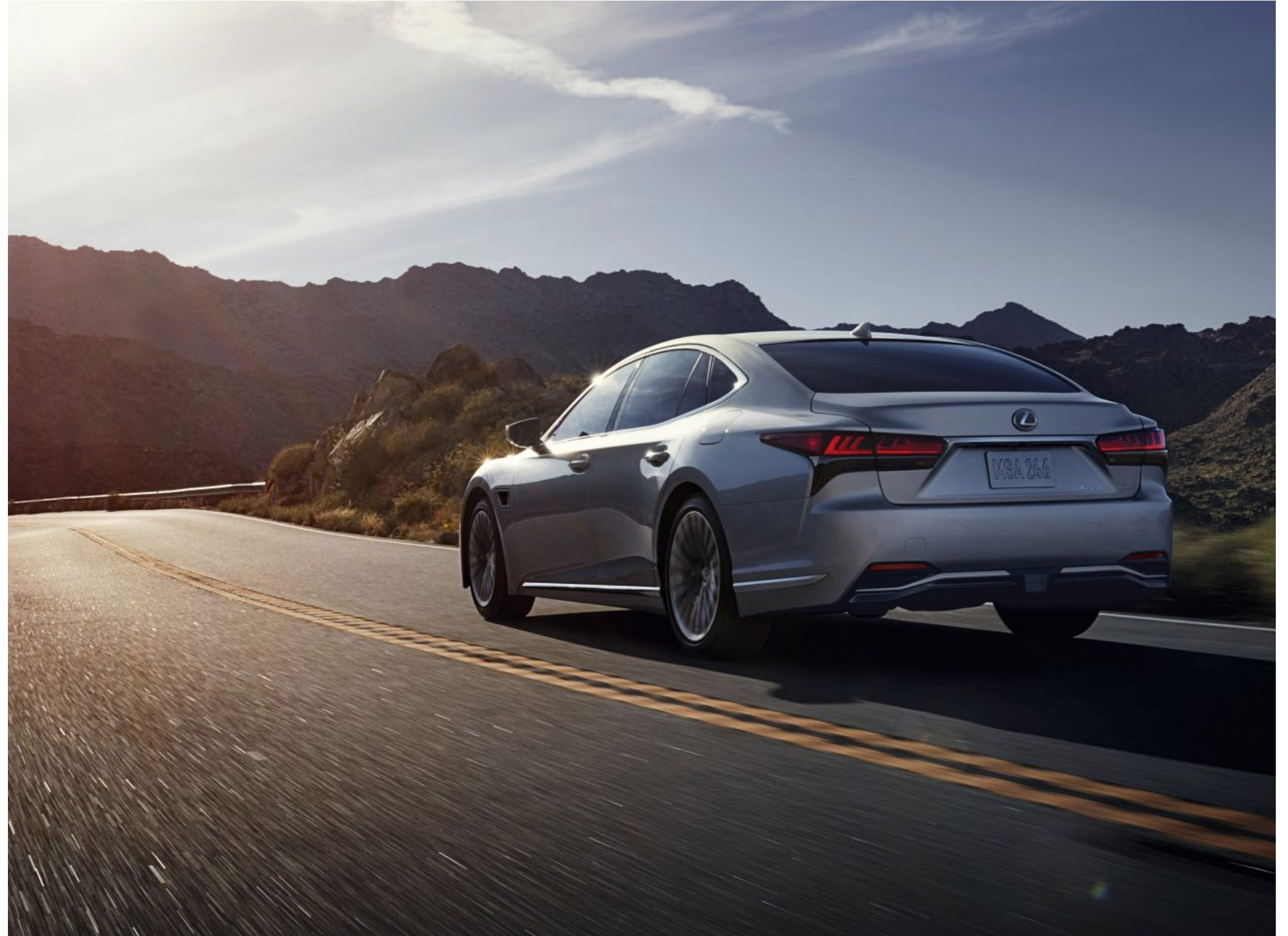
LSh shown in Atomic Silver

The LS 500h AWD is the only multistage hybrid prestige luxury sedan, and with the instinctive feel of a 10-speed automatic transmission, the most responsive and fastest LS Hybrid we've ever created. Built on an advanced powertrain, it boasts a combined 354-hp 2 total system power, 24-valve gas engine, powerful yet compact electric motors, and our lightest, most compact lithium-ion battery. With these impressive performance metrics, all-wheel drive capability and next-generation driver-assistance technology, the LS 500h AWD is the breakthrough that recasts the entire concept of excellence in the category.