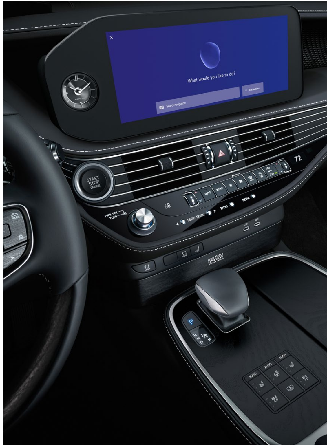
LS shown with Black leather and Kiriko Glass interior trim

The product of a relentless focus on crafting vehicles that put people first, the 2024 LS features intuitive technology throughout. With Lexus Interface 1 , an active Drive Connect 4 trial or subscription offers the benefit of an Intelligent Assistant that enables voice control of commonly used functions. While the LS Hybrid offers Lexus Teammate with Advanced Park 5 and Advanced Drive 6 capability, also powered by an active Drive Connect trial or subscription, to help seamlessly integrate with you for added convenience and peace of mind. Inside, a driver-centric cabin boasts one of the most sophisticated 3D audio experiences available in an automobile: the world's first Mark Levinson ®7 QuantumLogic ® Immersion.