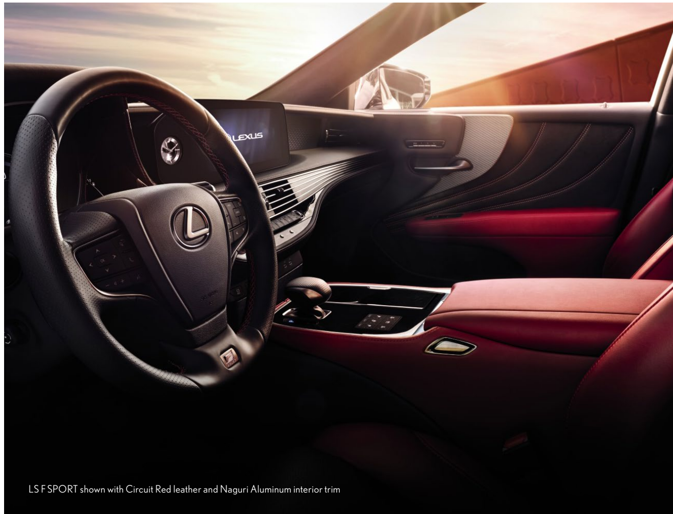
LS F SPORT shown with Circuit Red leather and Naguri Aluminum interior trim