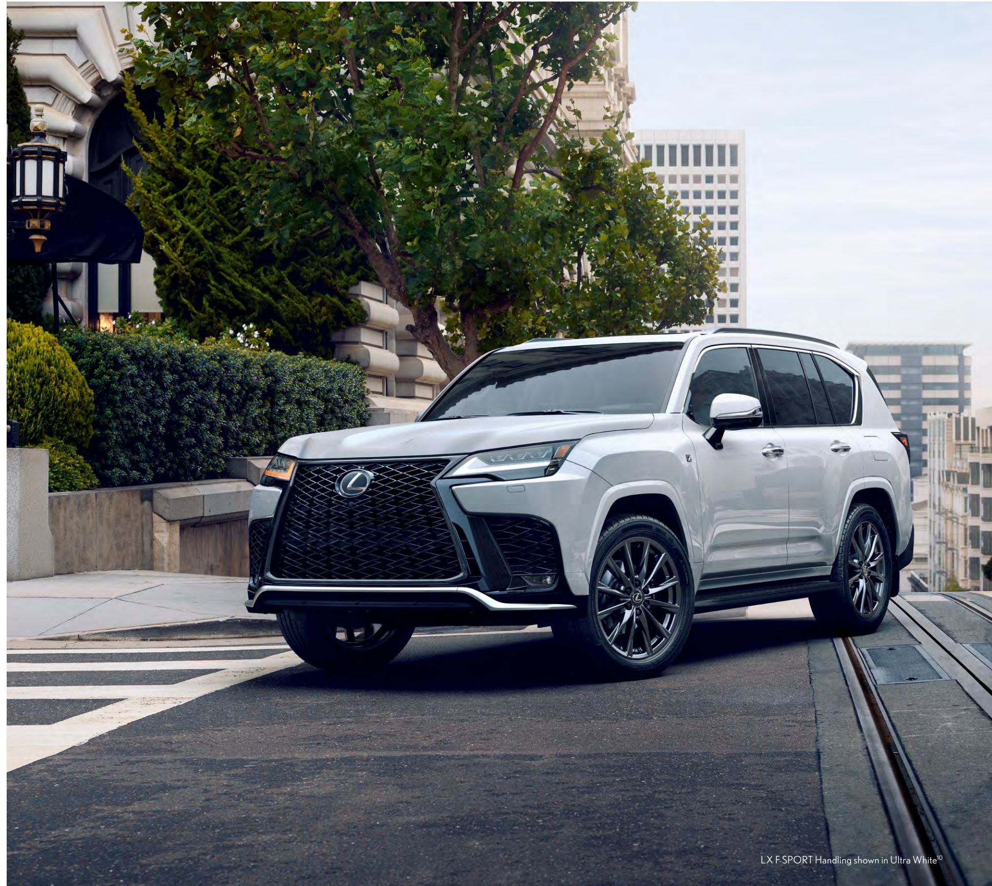
LX F SPORT Handling shown in Ultra White 0

Forged alloy wheels with Silver finish STANDARD LX Ultra Luxury