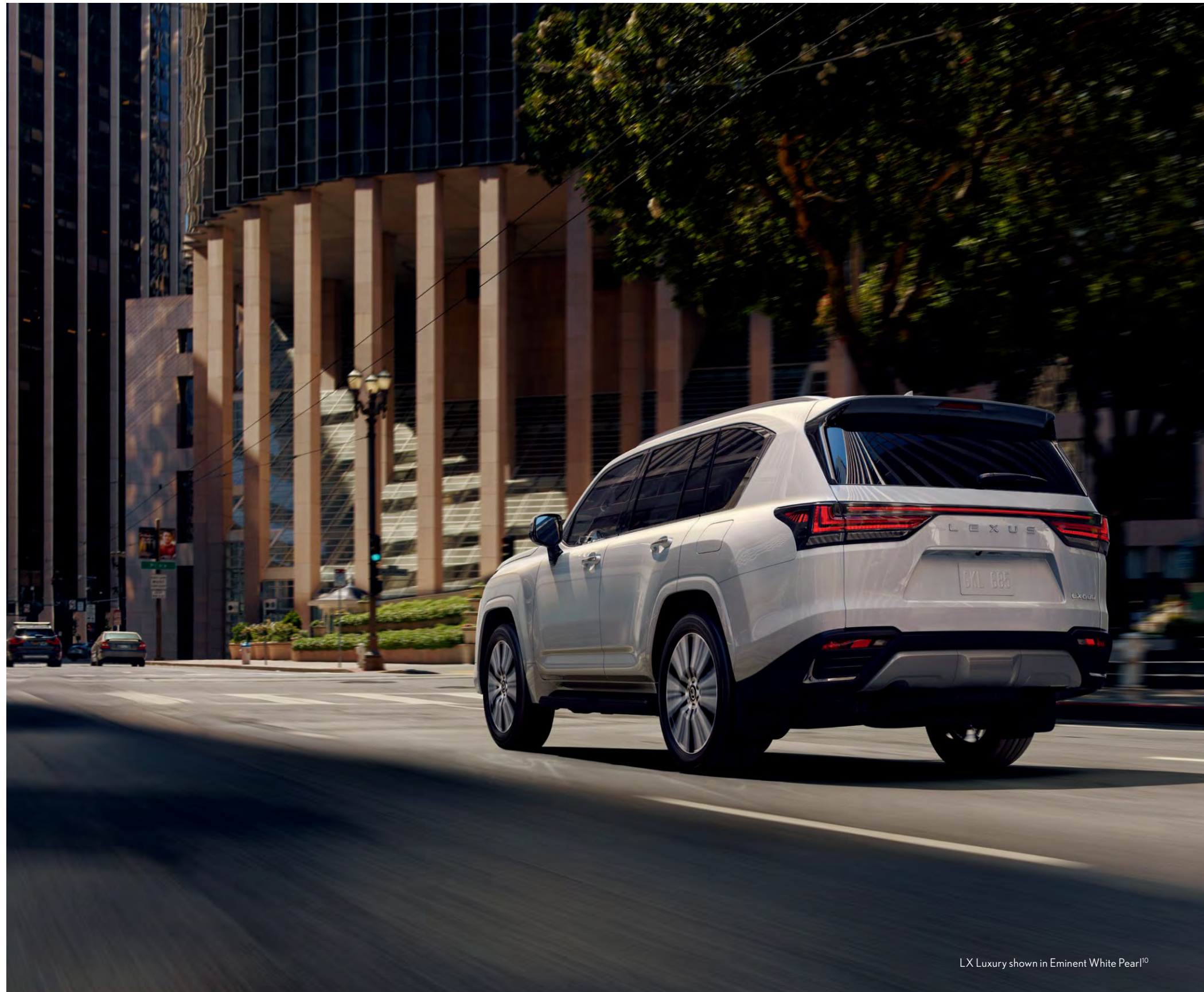
LX Luxury shown in Eminent White Pearl 10