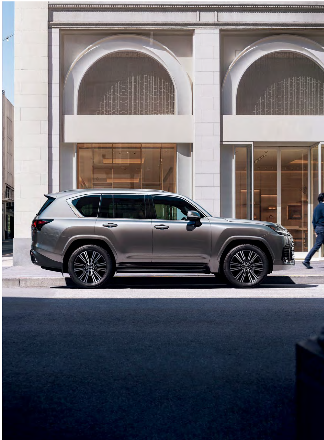
LX Luxury shown in Atomic Silver