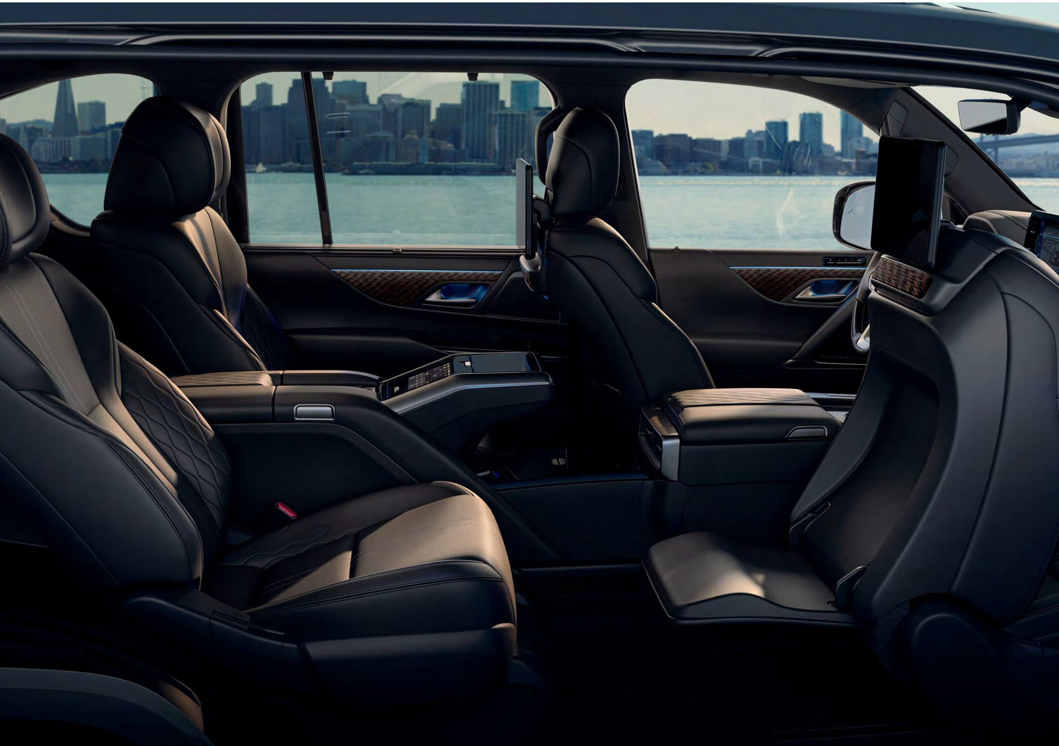
LX Ultra Luxury shown with Black semi-aniline leather and Takanoha Wood interior trim