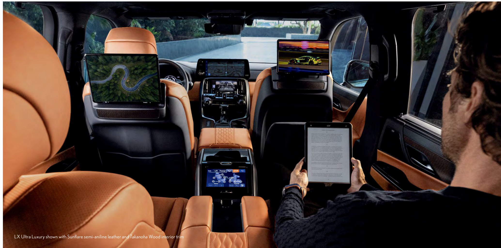
LX Ultra Luxury shown with Sunflare semi-aniline leather and Takanoha Wood interior trim