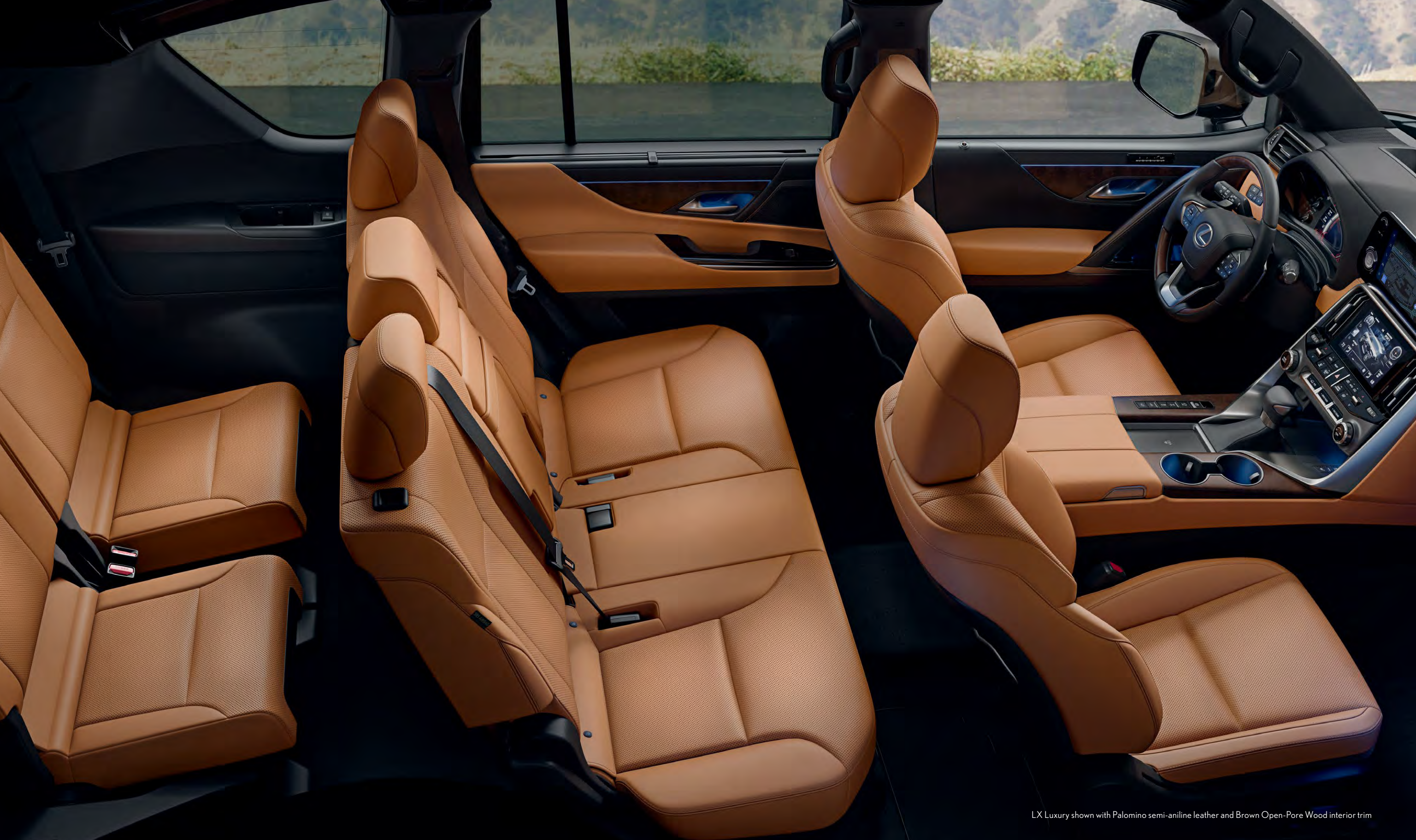
LX Luxury shown with Palomino semi-aniline leather and Brown Open-Pore Wood interior trim