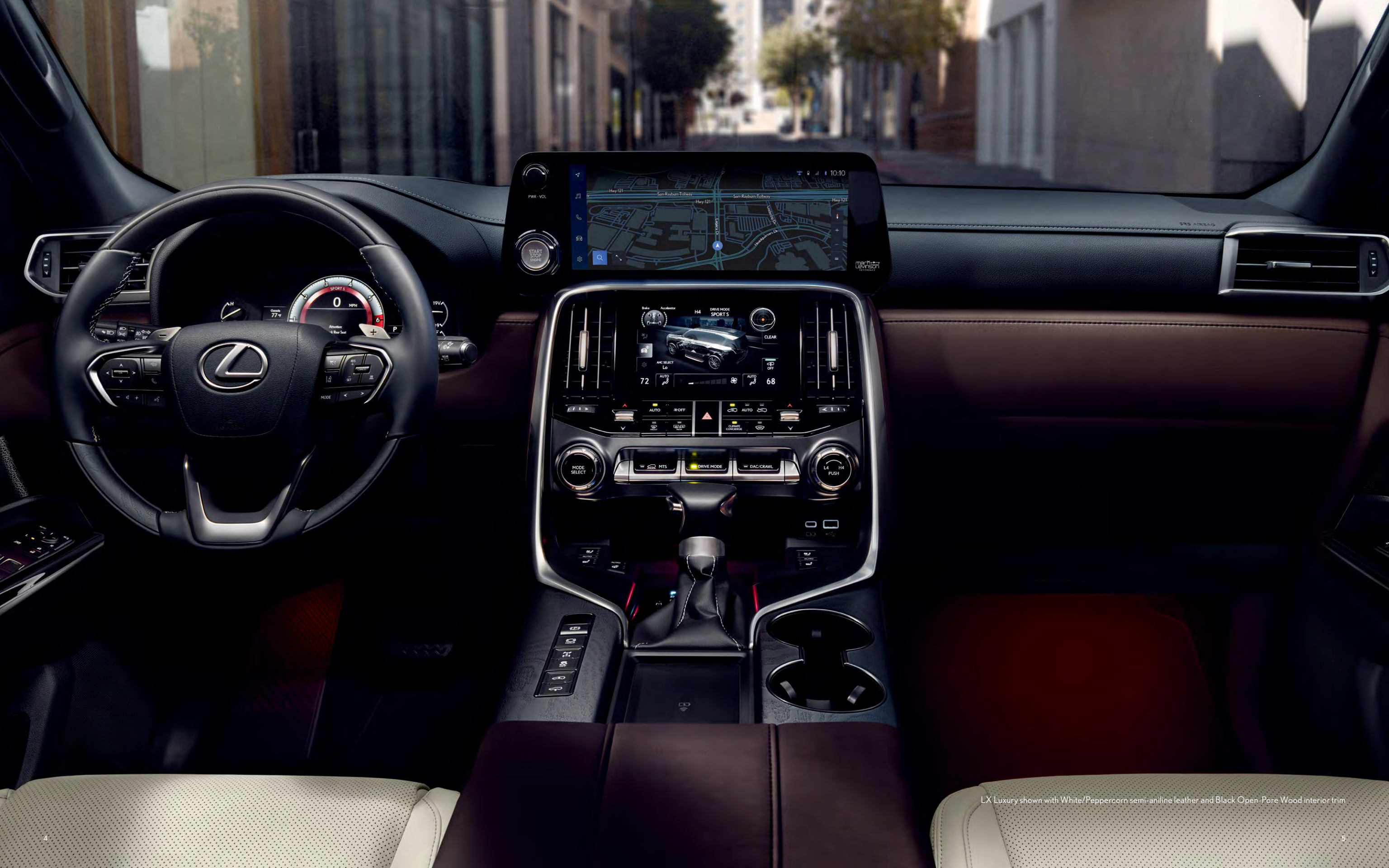
LX Luxury shown with White/Peppercorn semi-aniline leather and Black Open-Pore Wood interior trim