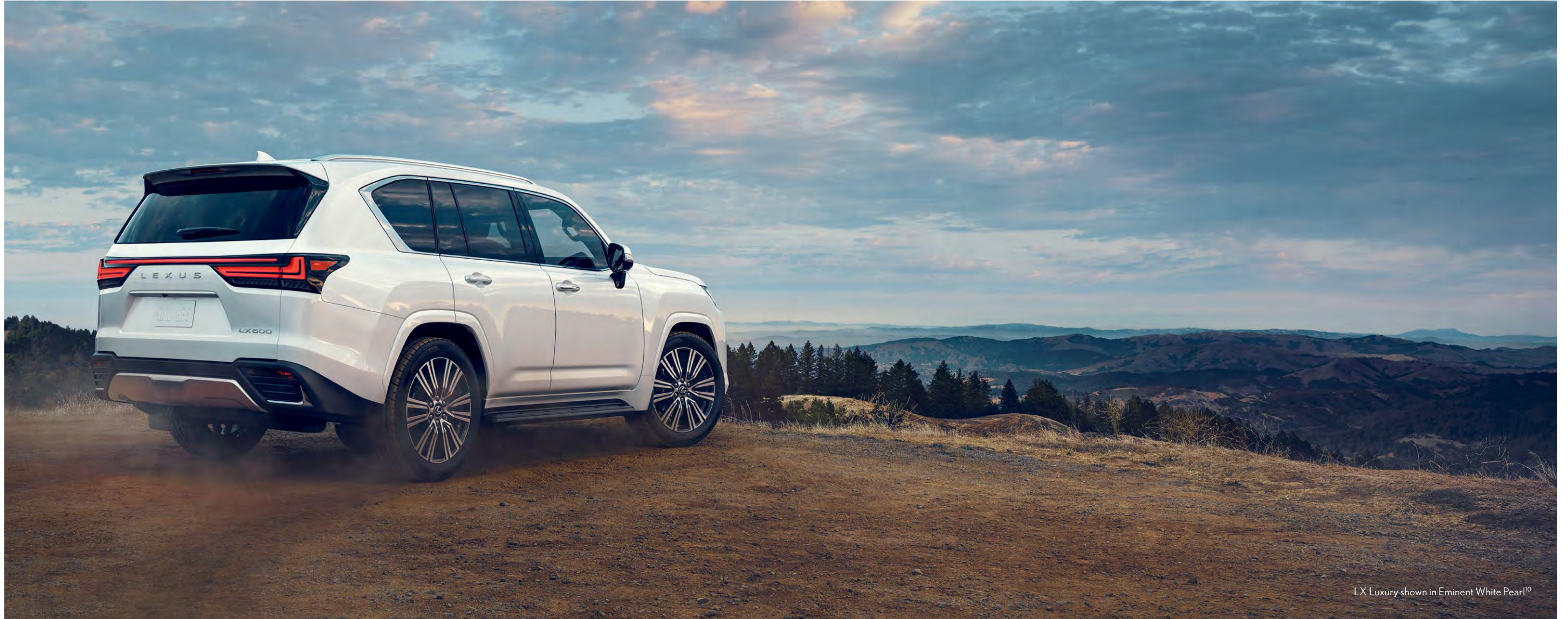
LX Luxury shown in Eminent White Pearl 10