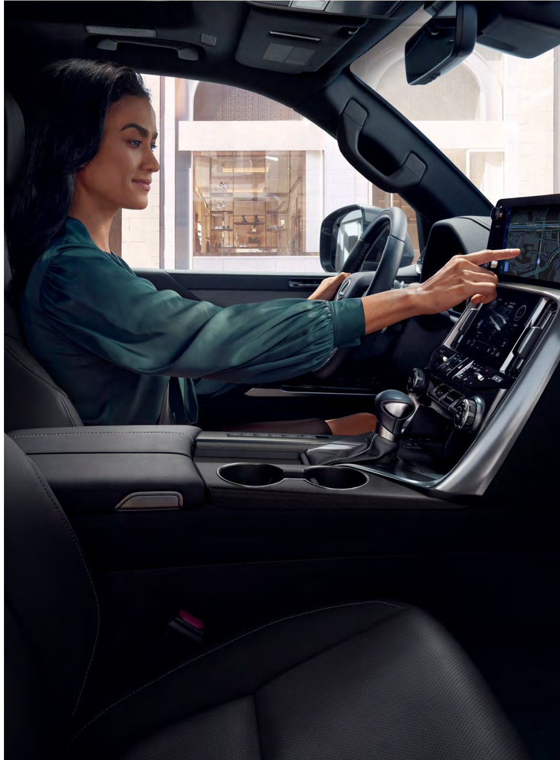
LX Luxury shown with Black semi-aniline leather and Black Open-Pore Wood interior trim (left); LX interior shown with Apple CarPlay 4 integration for iPhone 4 (right)

The greatest technology is that which takes the least effort to understand—technology so intuitive that having more of it actually feels like less. Case in point: Lexus Interface 3 seamlessly connects you via touchscreen—or voice—to the many benefits of an active Drive Connect 19 trial or subscription. Its Intelligent Assistant feature gets smarter over time, and Cloud Navigation offers more accurate directions. Lexus Interface also wirelessly integrates with Apple CarPlay 4 for your iPhone ® , or Android Auto ™20 for your Android ™ phone. It's the convenience of more than 19 inches of screen access, including a lower display that's designed to inform, not distract. The product of relentless imagination and human-centered design, this is technology as it should be.