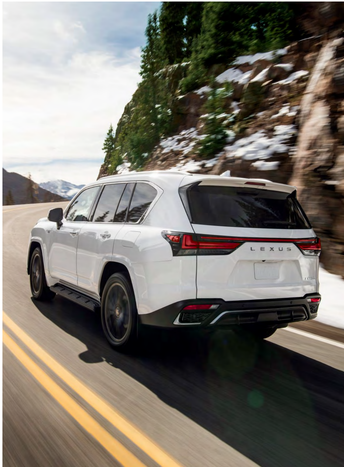
LX F SPORT Handling shown in Ultra White 10