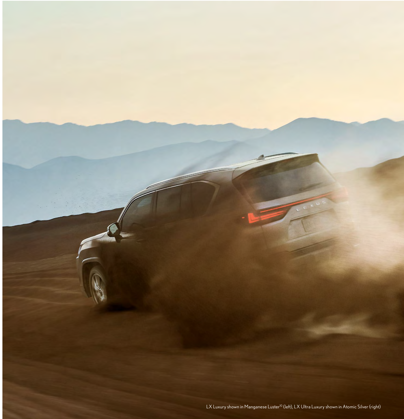
LX Luxury shown in Manganese Luster 10 (left), LX Ultra Luxury shown in Atomic Silver (right)