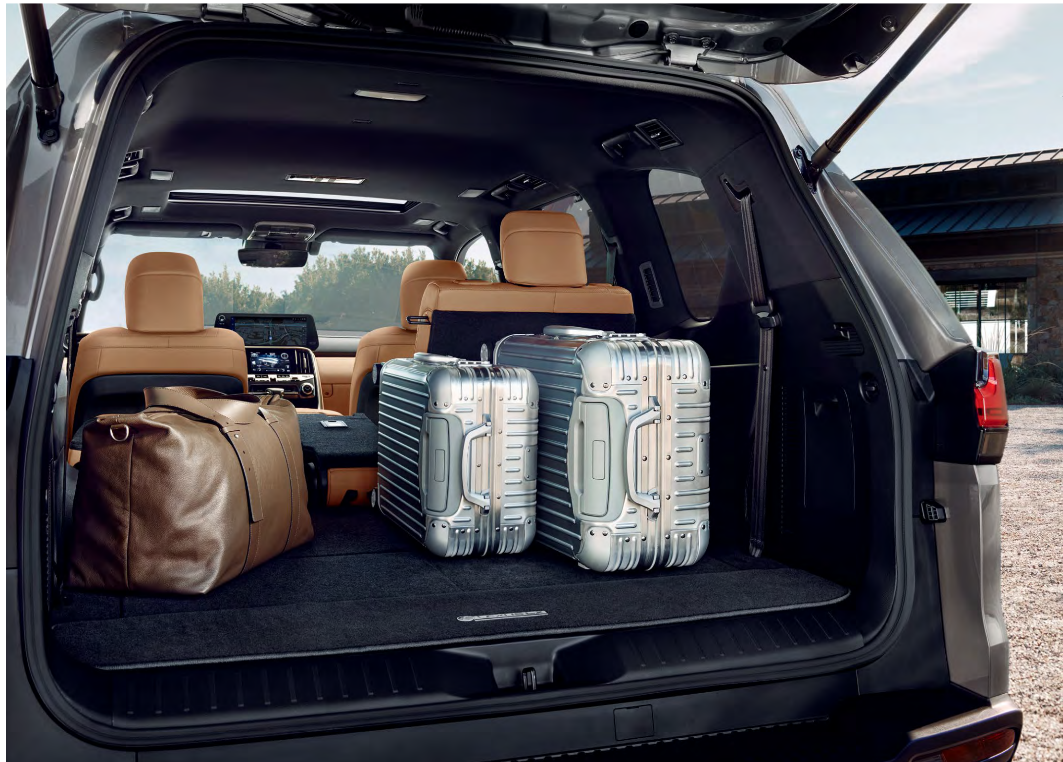
LX Luxury shown with Palomino semi-aniline leather and Brown Open-Pore Wood interior trim

With just the press of a single button, this available feature enables you to configure all the seating automatically to provide maximum cargo space. First, the front seats temporarily move forward, then both second and third rows fold down.