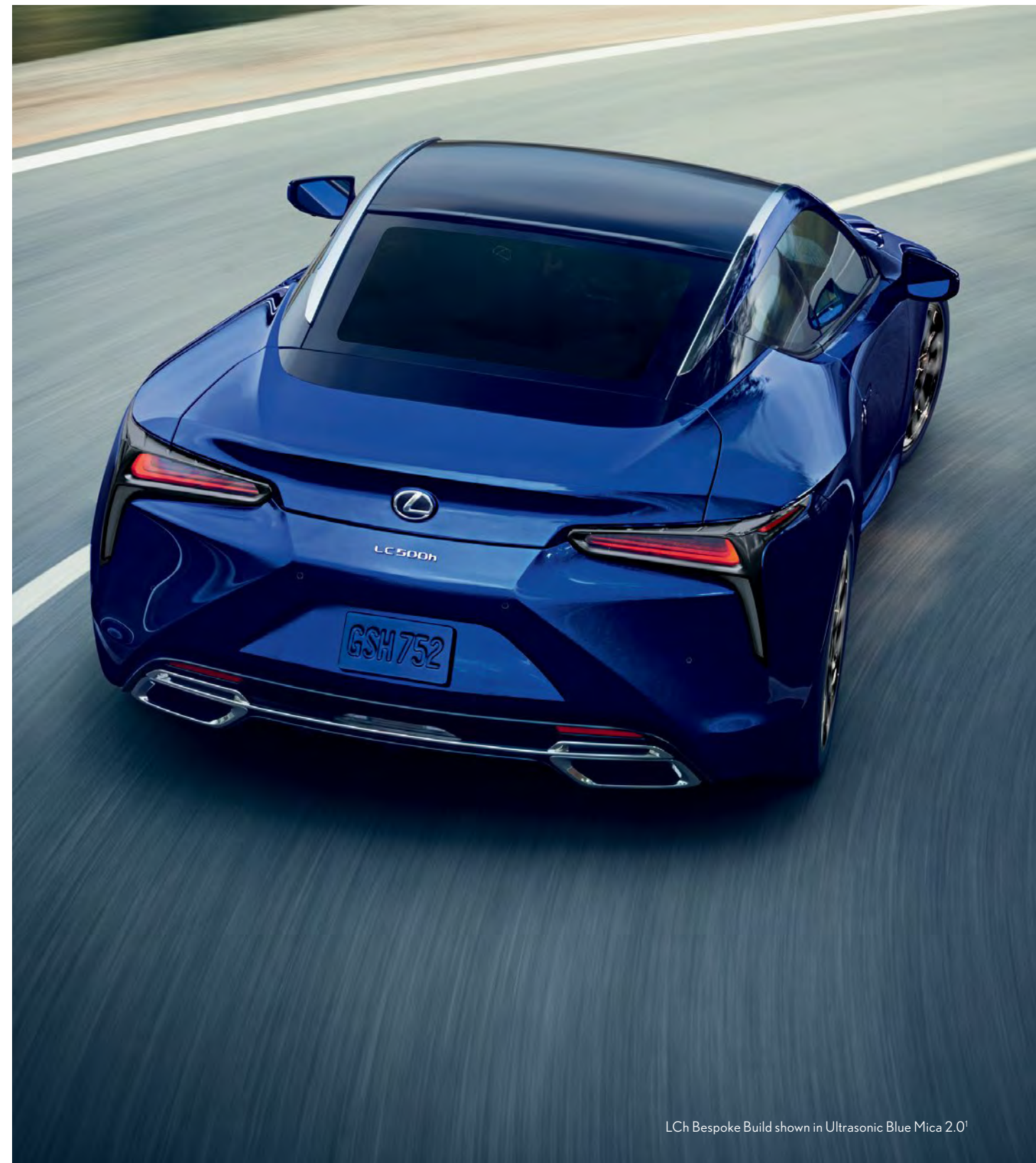
LCh Bespoke Build shown in Ultrasonic Blue Mica 2.0 1