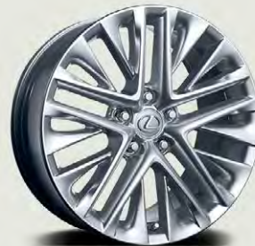
18-in split-10-spoke alloy wheels 12 with High Gloss finish OPTIONAL ES