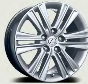
17-in split-six-spoke alloy wheels 10 STANDARD ES