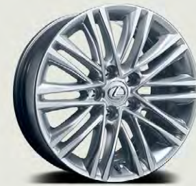
17-in split-10-spoke alloy wheels 10 with High Gloss finish OPTIONAL ES