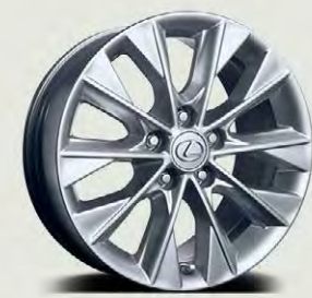
17-in split-five-spoke alloy wheels 10 STANDARD ESh